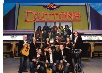
THE DUTTONS CHRISTMAS SHOW