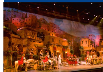
THE MIRACLE OF CHRISTMAS Show at the Sight & Sound® Theatre