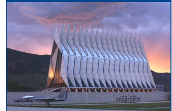
Visit to the U.S. Air Force Academy

$75 Due Upon Signing. *Price per person, based on double occupancy. Add $445 for single occupancy. Final Payment Due: 7/3/2022