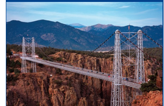
Visit to the Royal Gorge Bridge and Park