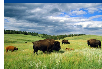
Wildlife enhances the pristine Black Hills

$75 Due Upon Signing. *Price per person, based on double occupancy.