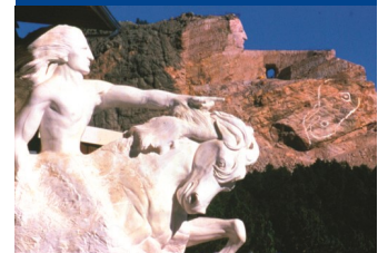
Crazy Horse Monument to be 10x the size of Mt. Rushmore