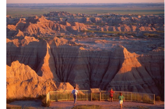
Spectacular Badlands National Park