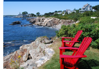
Explore quaint Kennebunkport