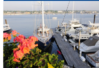
Enjoy the historic Portland Waterfront