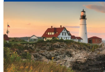
See the Portland Head Lighthouse