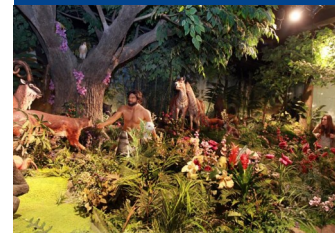
Visit to the Amazing Creation Museum!