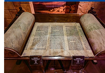
Enjoy the Bible Scroll Exhibit at the Ark Encounter