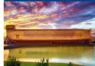
Incredible Ark Encounter

$75 Due Upon Signing. *Price per person, based on double occupancy. Add $179 for single occupancy. Final Payment Due: 3/30/2022